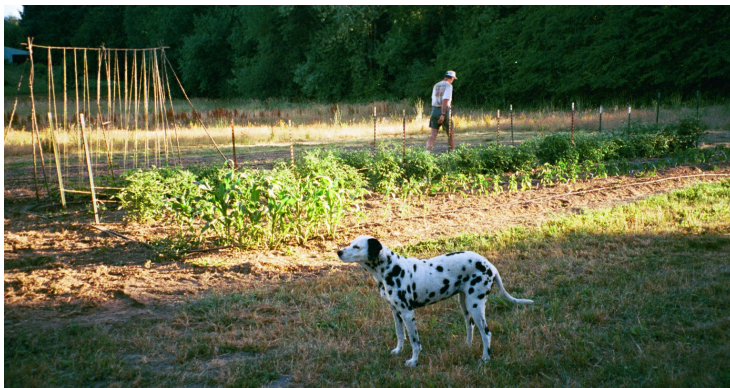
Mingus (now 13) surveys the garden

But it's not all work... soon the harvest begins! Cherries in June, berries and beans in July, plums, cucumbers and strawberries in August, pears, white grapes, eggplant, tomatoes, and chili peppers in September, basil, red grapes, pumpkin, and squash in October, apples in November. Harvesting, canning, roasting, drying, cooking, and eating... the summer and fall were some of the busiest times we've ever experienced. This year we understand what the Thanksgiving celebration is really about.